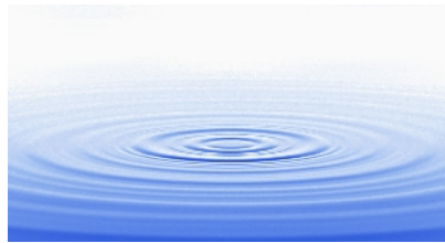
Our UCW Logo

You are also going a long way to clearing the issues for the whole of Humanity; the whole of the Earth; the whole of the Universe and so on in a huge domino rolling or expanding wave effect.